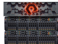
FIGURE 2: FlashArray//C60 capacity scaling